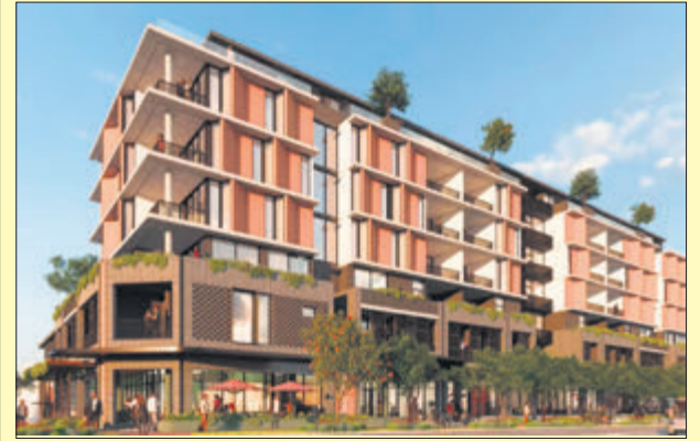
• Seven-ish storeys: Space Collective Architects' design for 299 Charles Street.

Anyone interested in joining up is encouraged to come along and have a look around during opening hours on Mondays and Thursdays 8.30am to 12.30pm, Tuesdays 8.30am to 4pm, and Saturdays 9am to 4pm.