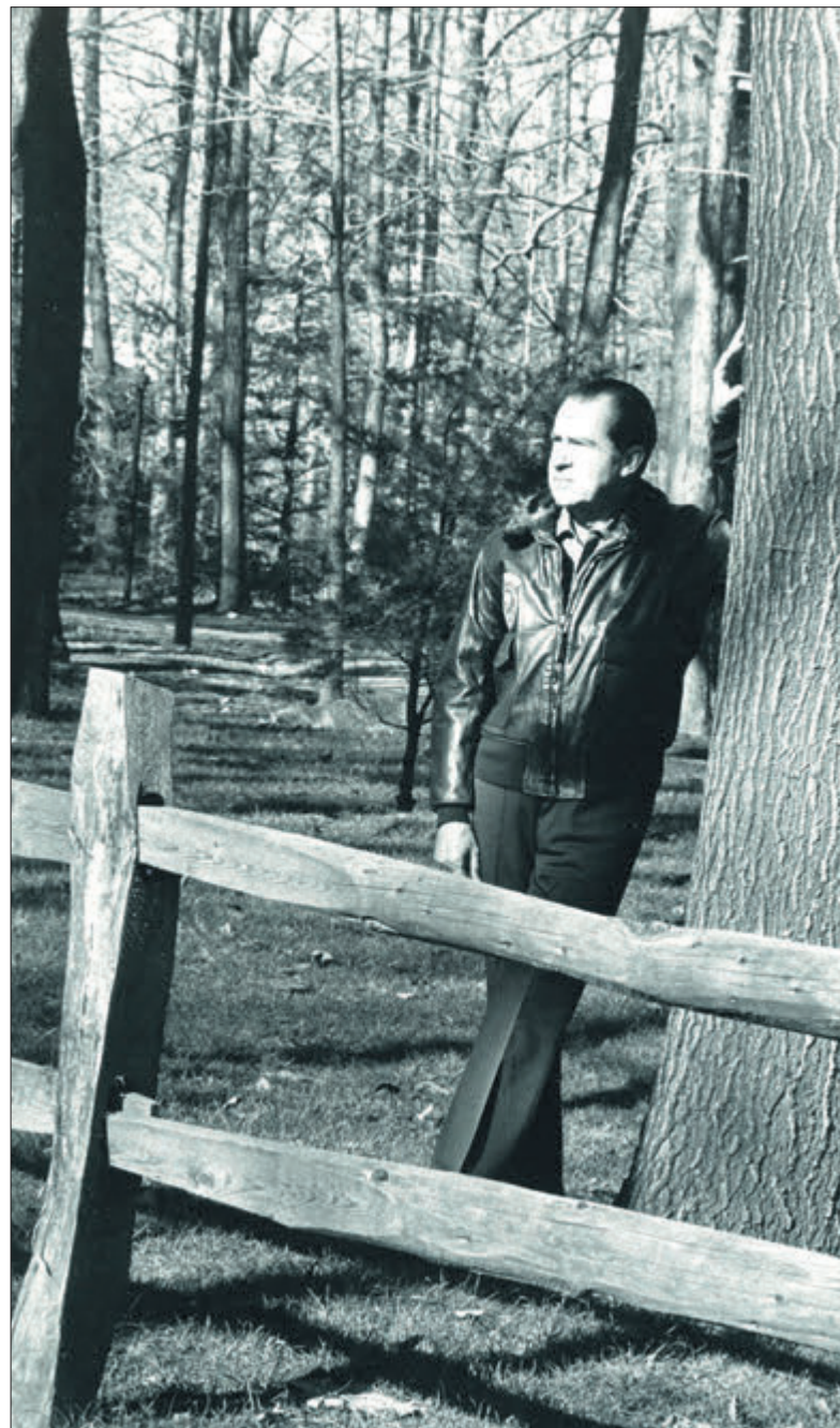
• President Richard Nixon at Camp David in 1971.