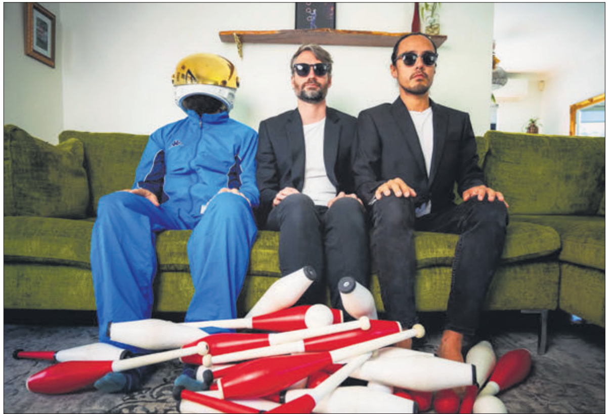
• Fremantle-based Acrobatch mix juggling, acrobatics and satire in a contemporary circus show.

happens when three friends get together and put all of our silliest ideas and coolest tricks into one show," he says.