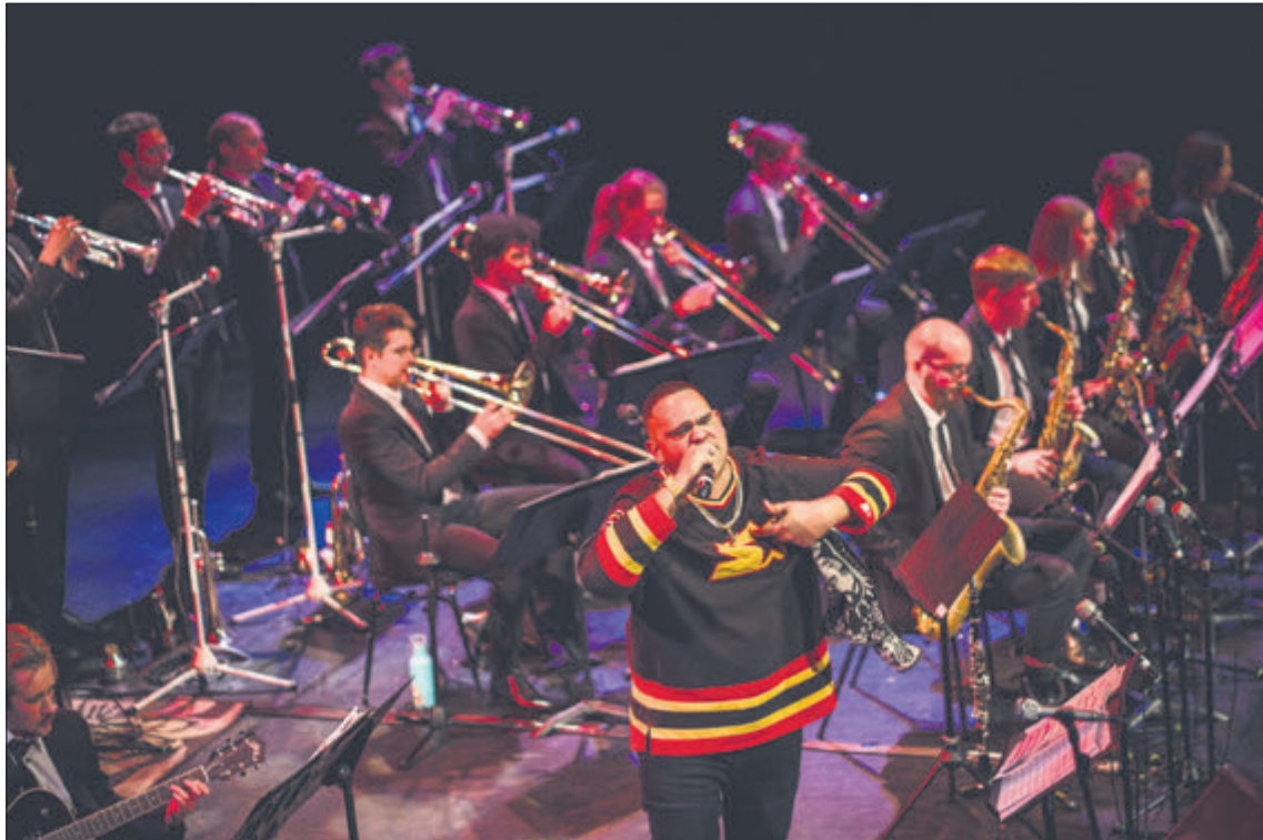
• ZERO Emcee, who's previously performed with WAYJO and taught hip hop to detainees in the Don Dale Detention Centre.