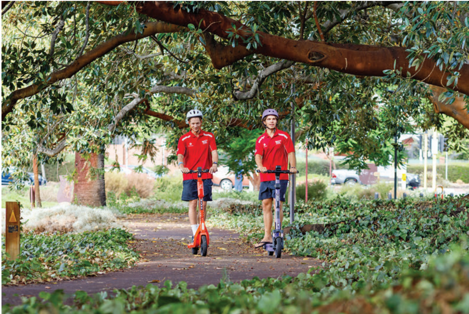
• Beam Mobility is hoping for a e-revolution in cities, joining Neuron in taking advantage of the City of Vincent's e-scooter trial.