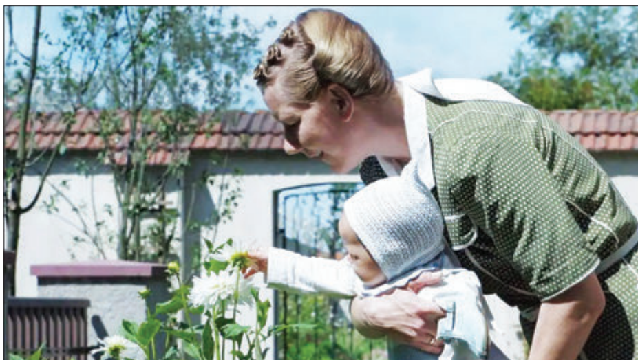
• Domestic bliss just metres from the horrors of Auschwitz in The Zone of Interest .

A NEW movie of stark contrast by British film director Johnathon Glaser, The Zone of Interest depicts the lives of a German commandant and his family living next door to Auschwitz.