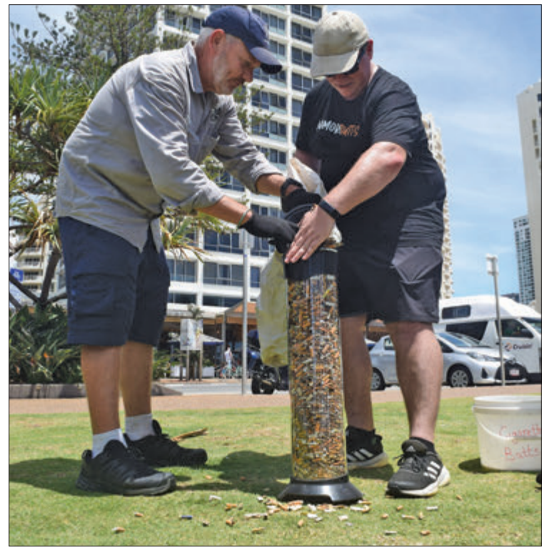
• No More Butts volunteers have a mammoth effort keeping up with lazy smokers.

A 2021 report commissioned by the World Wide Fund for Nature Australia estimated 8.9 billion cigarette filters were carelessly discarded across Australia every year; each one starts leaching chemicals into