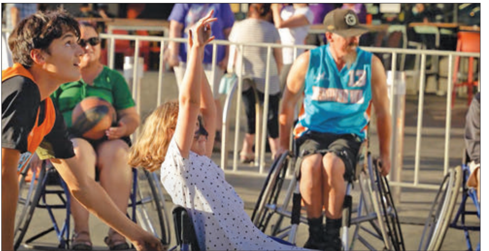
• Action from last year's Para Sport Festival.

For further details or to reserve your spot, visit bit.ly/COB-Library-Eventbrite .